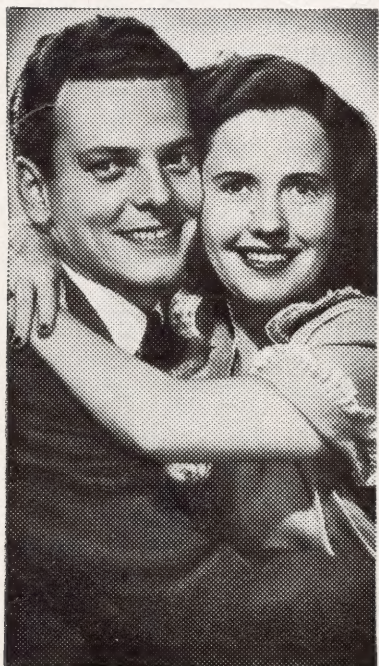
Mat 1-A; Still No. 43

Character actor Thurston Hall, specialist in Southern roles, is featured in Columbia's "Girls' School," starring Joyce Reynolds at the . . . . . Theatre, as an impoverished Southern colonel who operates an exclusive academy for young ladies. Thurston presides over the school when it is jolted by scandal as a result of a mysterious $30,000 possessed by student Joyce Reynolds.